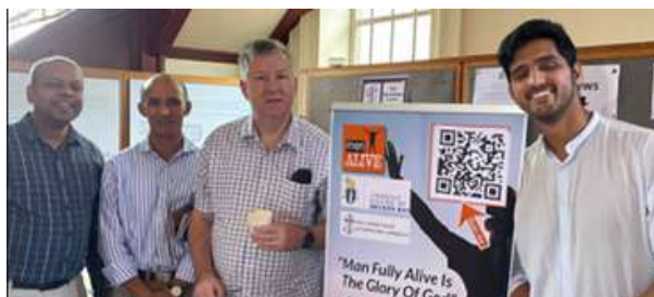
The good men serving morning tea at OLHC on the 25th February!